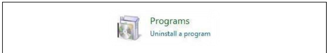
Figure 2. Uninstall a program